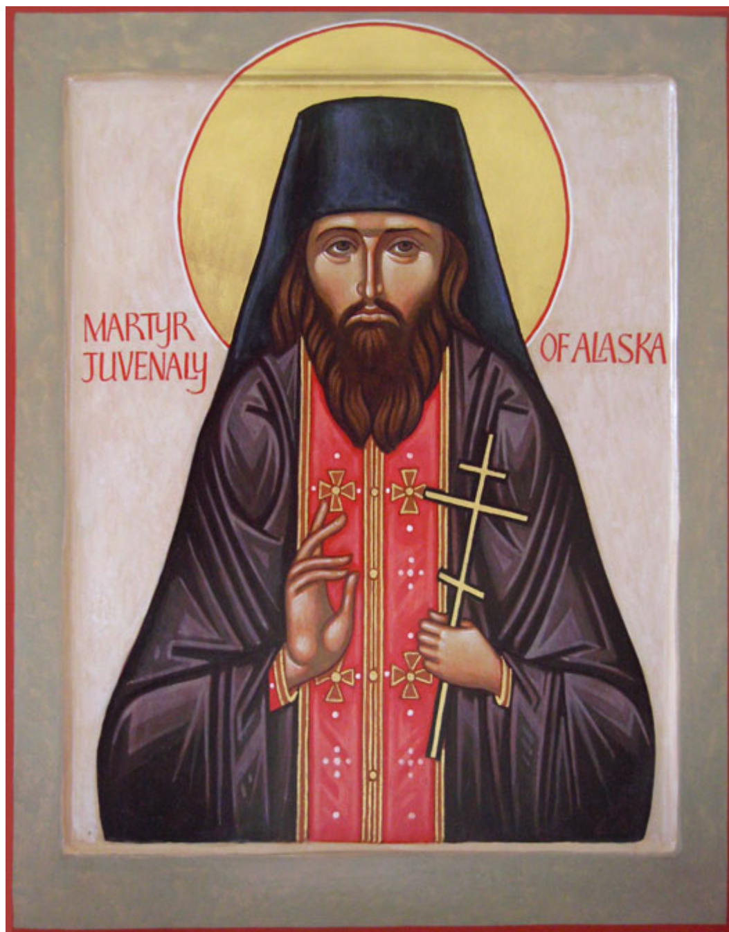
St. Juvenaly of Alaska. Ο άγιος Ιουβενάλιος της Αλάσκας.

The holy, glorious, right-victorious hieromartyr Juvenaly of Alaska, Protomartyr of America, was a member of the first group of Orthodox missionaries who came from the monastery of Valaam to preach the Word of God to the native inhabitants of Alaska. He was martyred while evangelizing among the Eskimos on the mainland of Alaska in 1796. His feast day is celebrated on July 2, and he is also commemorated with all the saints of Alaska (September 24), and with the first martyrs of the American land (December 12).