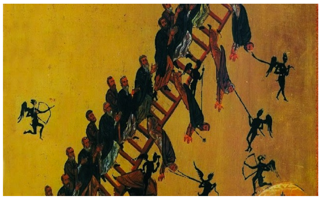
Evil has no natural existence and no-one is evil by nature. Because God did not