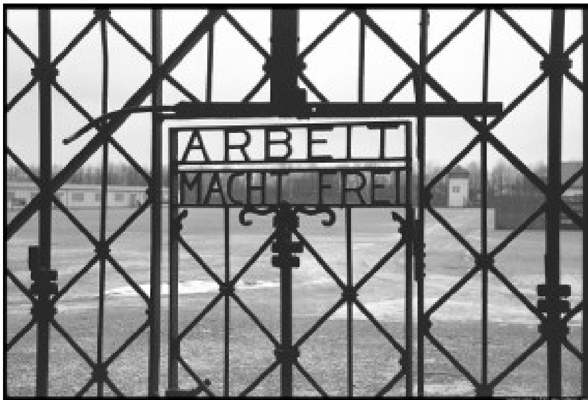
'Works Makes (=Sets You) Free', the macabre inscription on the camp gates

The humiliations of the prisoners came to an end in the spring of 1945, on 29 April. The testimony of the soldiers is staggering: