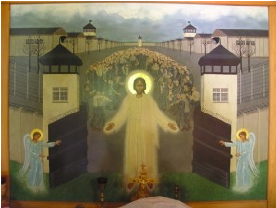
Christ opens the gates of a Hell on earth and brings the prisoners out into freedom Icon from the Russian chapel at Dachau

Countless prisoners died in the camp, while hundreds were forced to participate in the inhuman medical experiments conducted by Dr. Sigmund Rascher. Thousands of prisoners from other camps were also piled into railway wagons and sent to Dachau. The vast majority of these died horrific deaths from starvation, dehydration or exposure to diseases.