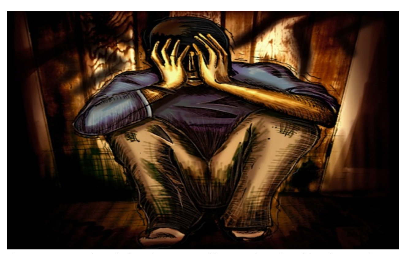
There's a worse inundation than water: if you're inundated by the passions. When