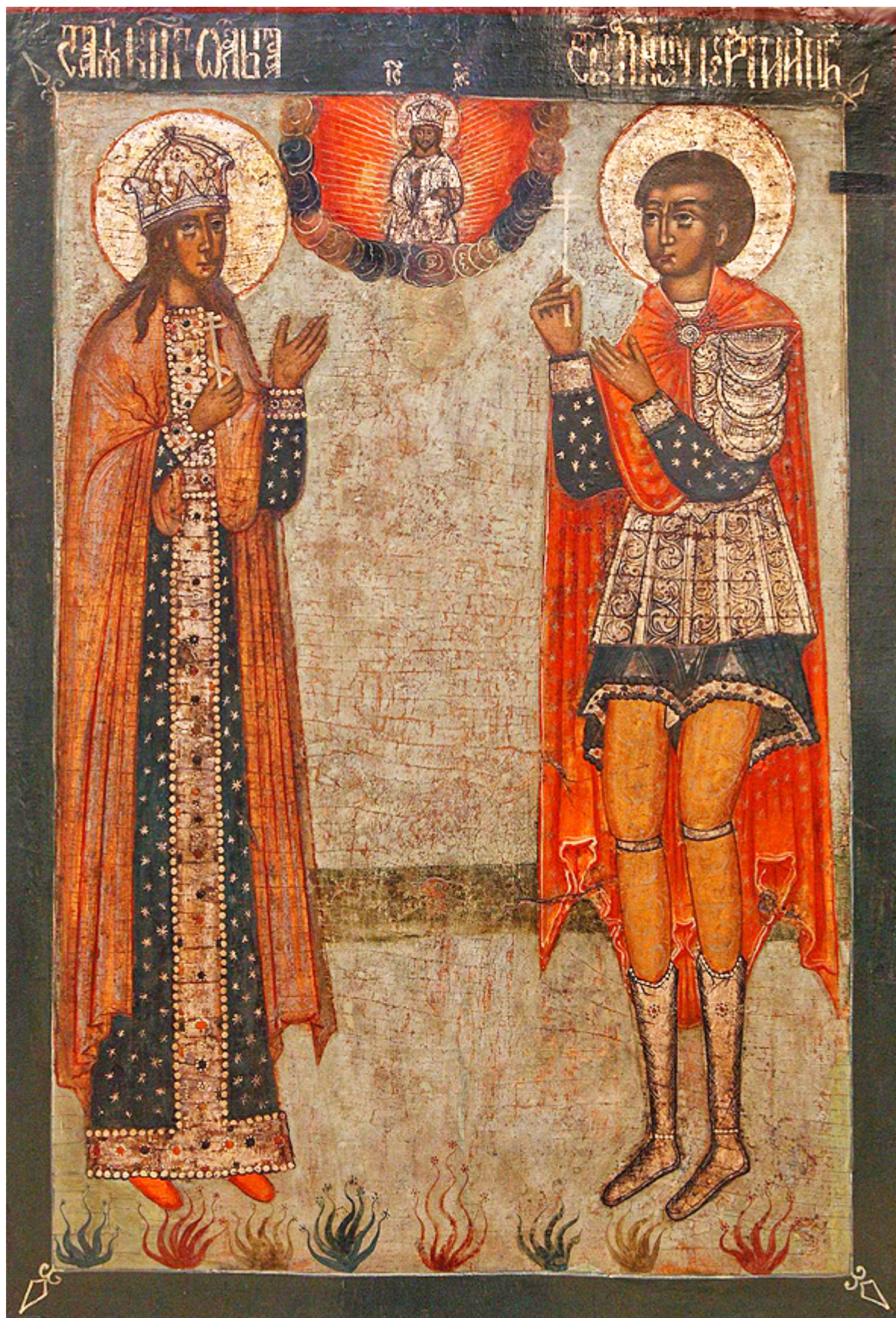
Saint Empress Olga and Saint Martyr George, Icon – Central Russia, 18th Century

When her son took over the reins of the state, Olga lived “for some years in deep peace, enjoying love of her son and people, likewise thanksgiving.” During this time she tried to pass on the evangelical light to her grandchildren, but she didn’t