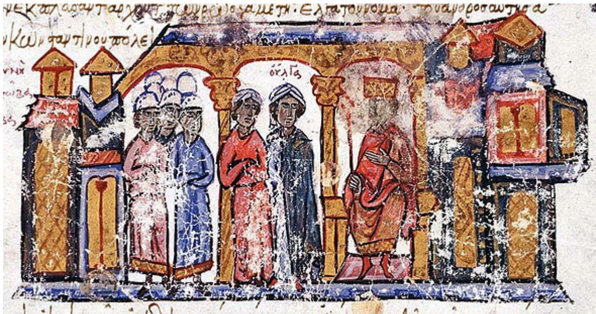
Saint Olga received by Emperor Constantine VII, byzantine manuscript, 12th century

read that after the murder of her husband, prince of Kiev Igor, she behaved with incredible cruelty and avenged not only to the killers but also to the whole tribe to which they belonged.