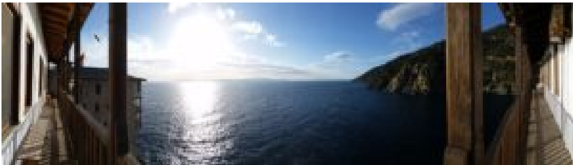
Monastery of Grigoriou

Spouts and water from the mountain, occasional springs here and there. Faucets and water at the entrance to the monasteries, cooling passers-by and visitors alike. Streams with refreshing, crystalline water, their sources in the ravines and, higher up, in the untrodden gorges or at the root of some oak tree seen only by God. Water that flows down to the sea, water that kisses Athos. Holy water in the forests of pine on the way to Saint Ann's. A spiritual spring of holy water. Every corner has a spring, overshadowed by a broad-leaved plane tree or crisscrossed with ivy. Refreshing moments when you quench your thirst, bodily and spiritually. Under the dense foliage the weather takes a rest. The paths as far as Vatopaidi are dripping with dew. An abundance of water on the way to Saint Ann's. Springs and little rivers towards the [former] Russian skete of the Prophet Elijah. They look just like the nooks frequented by Eros and the nymphs and the sites of their festivities in the thick woods. They're like moments of well-intentioned poetry, with the serene outburst of real contact, a moment of truth and an impulse restrained by faith on the path towards the one and only redemption.