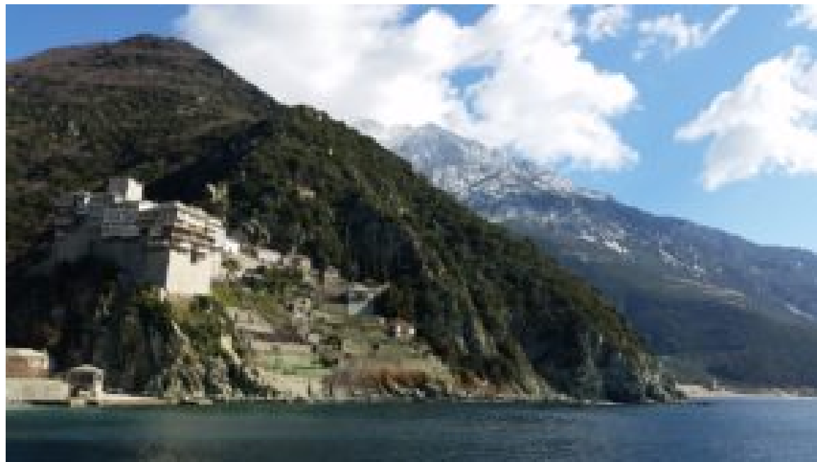
Monastery of Dionisiou

patience and endurance. Now these places are mostly abandoned but have great serenity. Each nest is a humble church, each sign a prayer-stand, each rock has heard words of faith. This is a landscape that cleanses you, lifts your spirits, and mitigates every sin. What thought is still the same afterwards, and how long can the battle of yesteryear last?