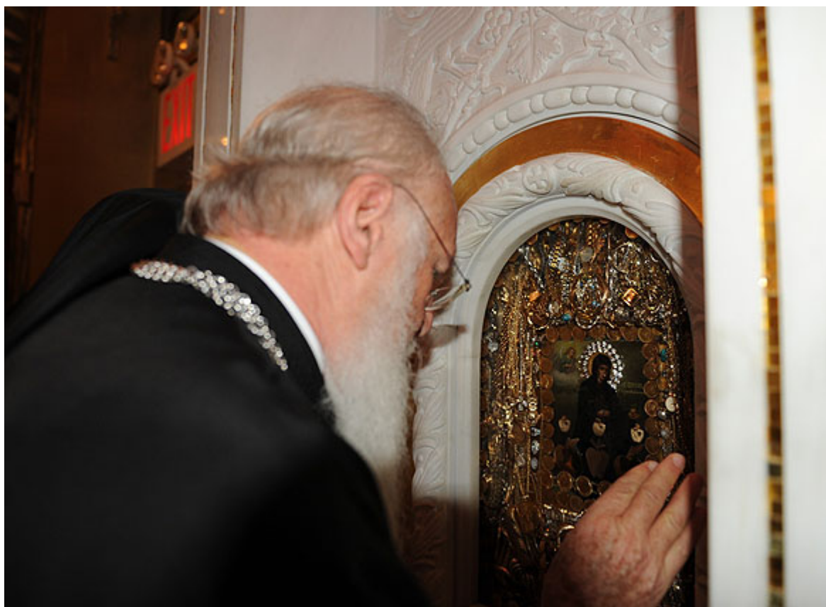
His All Holiness Ecumenical Patriarch Bartholomew during His visit at the Patriarchal Monastery of Saint Irene Chrysovalantou, NY (October 27, 2009)

Saint Irene reached the age of one hundred and three, retaining all her freshness and natural comeliness, a sign of the beauty of her soul. Her guardian angel told her a year in advance about the time of her demise and, when it came, she gathered the sisters, nominated the abbess whom God had chosen and, having admonished them to scorn things that are fleeting and so experience their beloved Bridegroom, she serenely closed her eyes and commended her soul into the hands of God. She was buried in the chapel of the holy martyr Theodore and her grave exuded the most wonderful aroma, manifesting to all the boldness she had acquired before God. To this day, Blessed Irene continues to intercede for those who call upon her with faith.