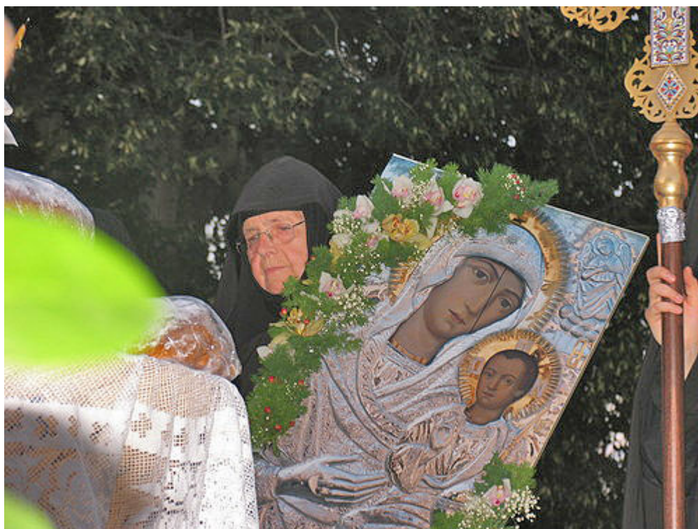
Procession with the icon of Our Lady Varnakova

The greatest and most sacred story is that which has been written by the Mistress of the World in her holy shrine over the last thousand years. It's the story of her loving-kindness, of her gifts and her love. She's a vigilant and ceaseless intermediary for us to Christ the Saviour, for all the faithful who ask for her intercessions.