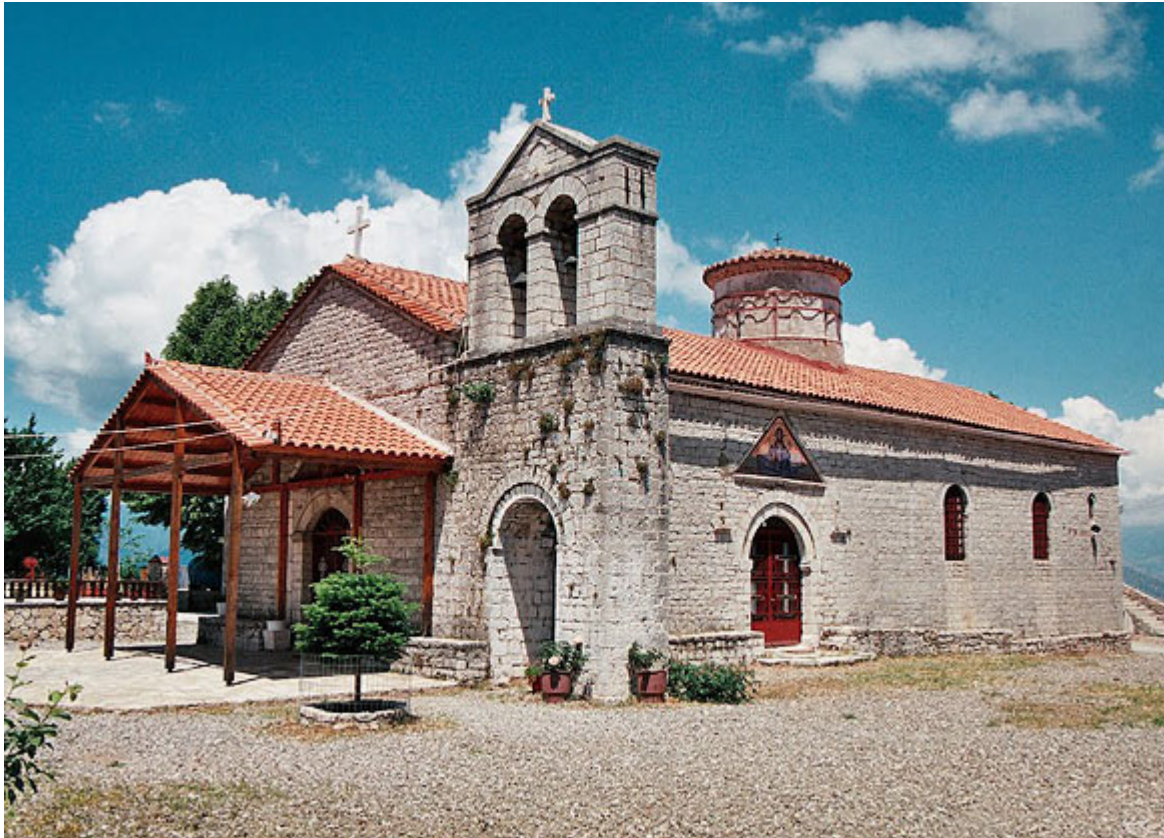
The katholikon of Monastery Varnakova, foto: Mixalis Ninoglou, Panoramio

The katholiko (main church) is in the style of a basilica with a cupola, while the floor is made of wonderful opus sectile marble, dating from the 11 th century.