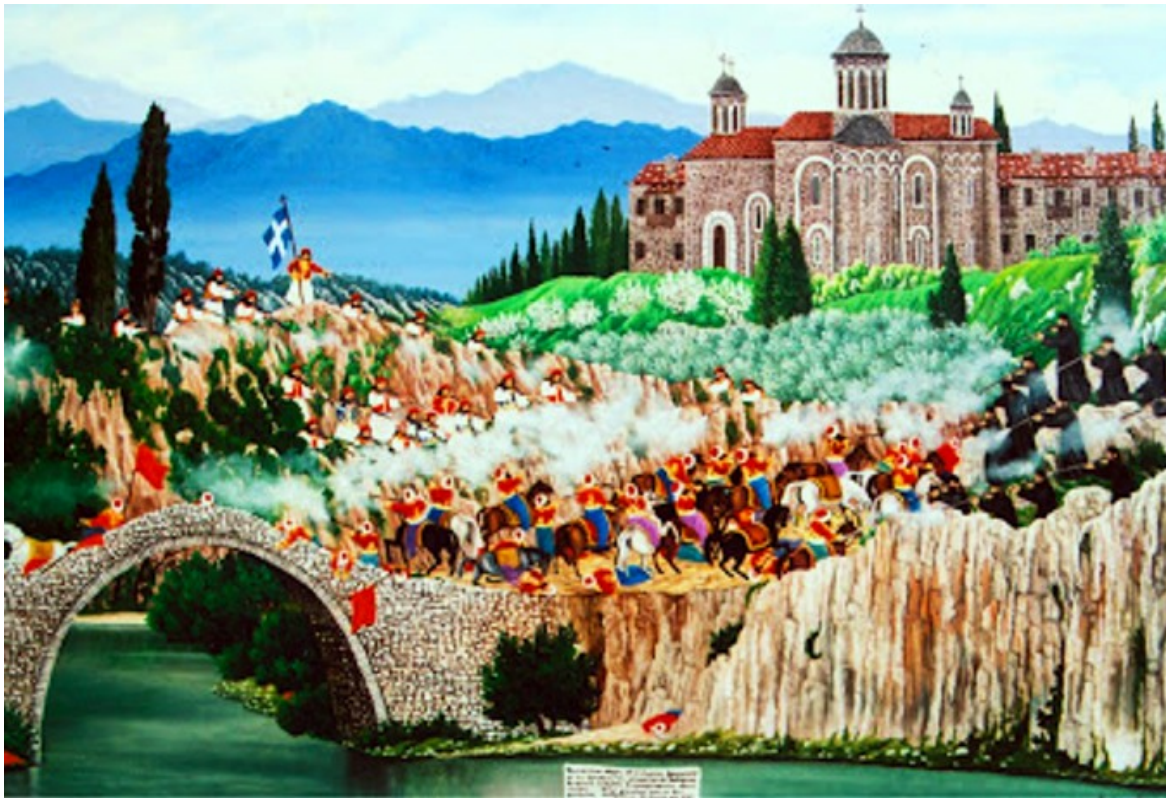
The turkish siege of May 1826 that lasted for 23 days

to leave on 26 May. The Turks took over the monastery and blew up the main church.