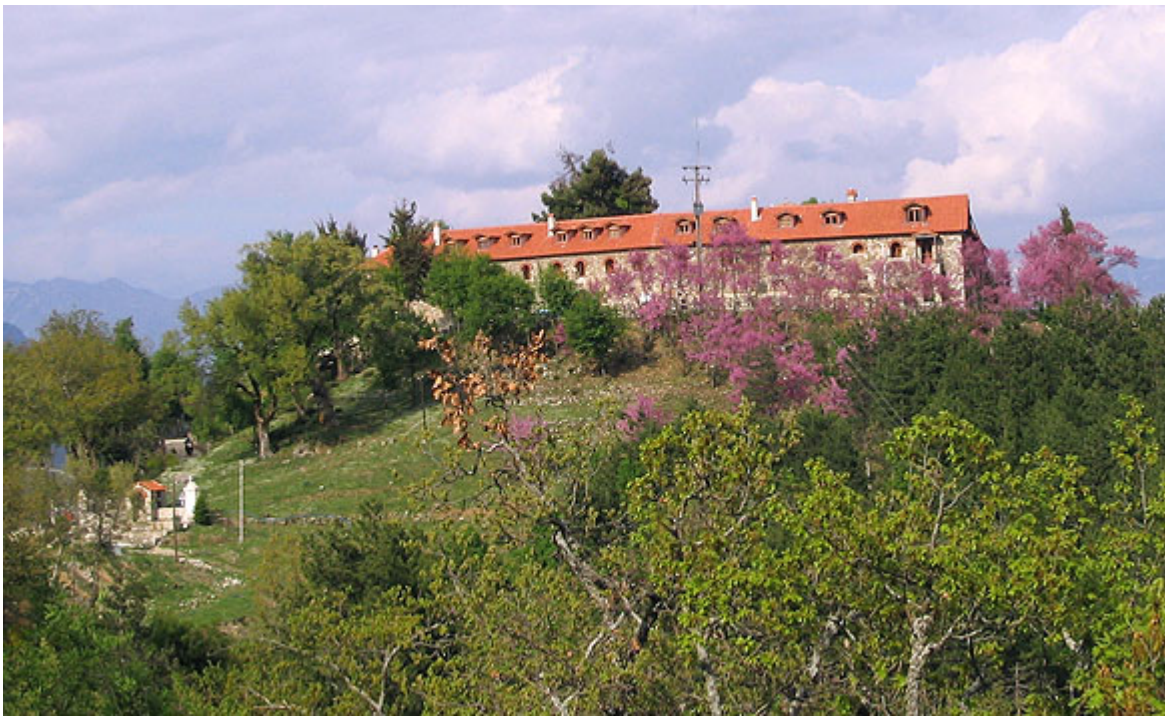
Monastery of Varnakova as seen from a nearby road

The Byzantine monastery of Varnakova lies some 45 minutes to the East of Nafpaktos, on the old road to Lidorikos, beyond Efpalio. It was built in 1077 by Saint Arsenios Varnakovitis, on a small hill which lies within a vast forest of oaks and wild chestnuts.