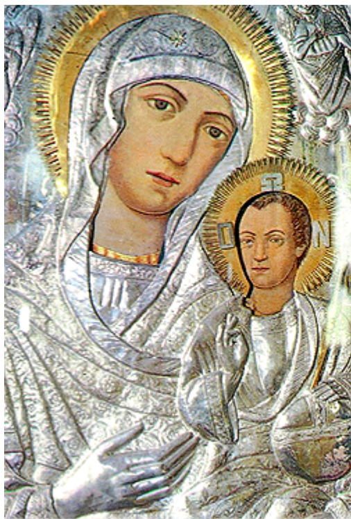
The icon of Our Lady Varnakova

In 1826, the monastery was partially destroyed by the Turks and was renovated by Ioannis Kappodistrias [the first 'Governor' of Greece after the revolution of 1821 and a most remarkable man] in 1831.