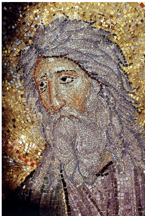
Jeremiah, San Marco Cathedral, Venice, 12th Century