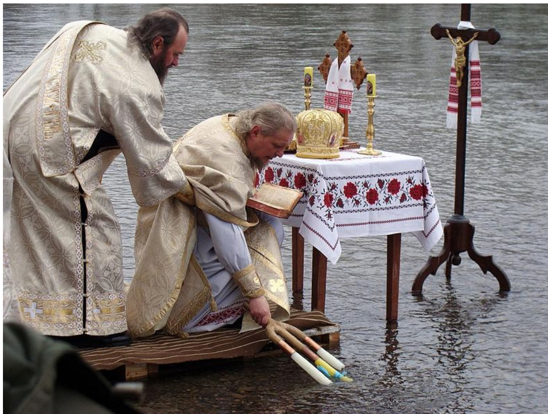
The Blessing of the Waters

As we celebrate Christ's Paschal victory – these thoughts are offered on the nature of our deliverance. One of the Psalms appointed for use in this season declares: "Now is the change of the Most High." Pascha is indeed God's change – which is why we ourselves are not the "agents of change."