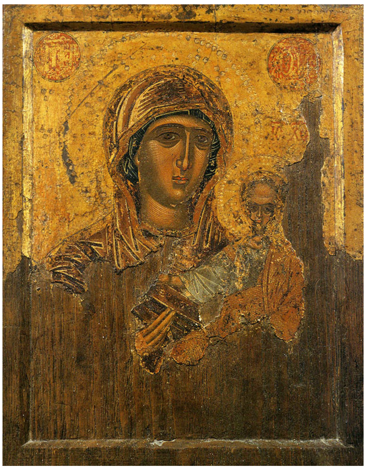
Theotokos (Mother of God), tempera on wood, Holy Mountain Athos, 17th Century

Here, then, is a first thing that Mary teaches us about freedom. It signifies relationship, openness to others, vulnerability. Without the risk and adventure of shared love, none of us can be free.