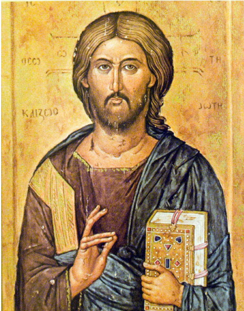
Icon of Jesus

Pontius Pilate's cry has been echoed down the ages and it seems that it has a particular resonance today when, intellectually speaking; only science seems to offer the kind of objective truth once claimed by theology itself. In some ways this shift has been accelerated by our shrinking world and the challenge of meeting those of other faiths. Of course, Christians knew of the existence of other religions in times past, but they were rarely encountered on home soil and could be just as easily be dismissed by the collective description "heathen" or perhaps "pagan." Today when your next door neighbour is likely to be a Muslim – at least in Europe- it is less easy for many to understand or even accept that in matters of faith one might be right and the other wrong. To the outsider, sympathetic or otherwise, faith has lost its anchorage in truth.