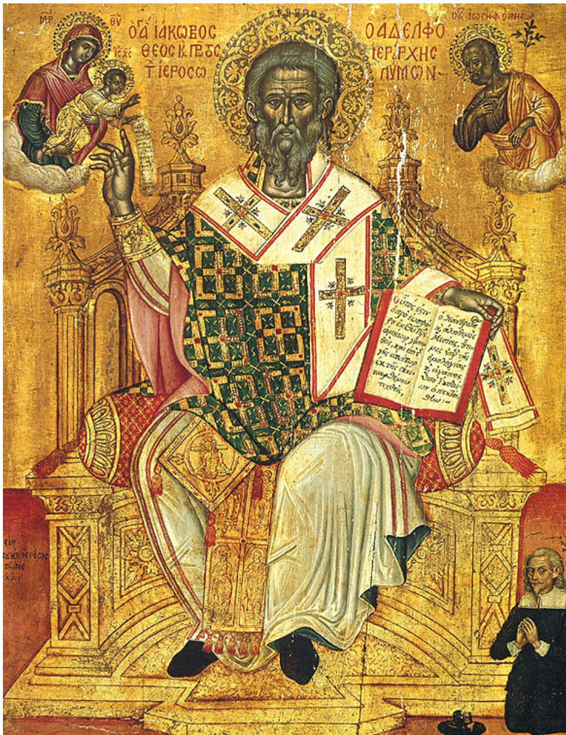
Saint James, the Brother of our Lord, Venetian Icon, 1683

After the Lord's Ascension, the Apostles unanimously elected James the Just as first bishop of Jerusalem. Perfect in all the virtues of action and contemplation, James alone entered the Holy of Holies of the New Testament- not once a year, like the High Priest of the Jews- but on a daily basis, in order to celebrate the holy sacraments. Dressed in a linen garment, he would enter the Temple and kneel for hours, praying for the people and the salvation of the world, to such an extent that