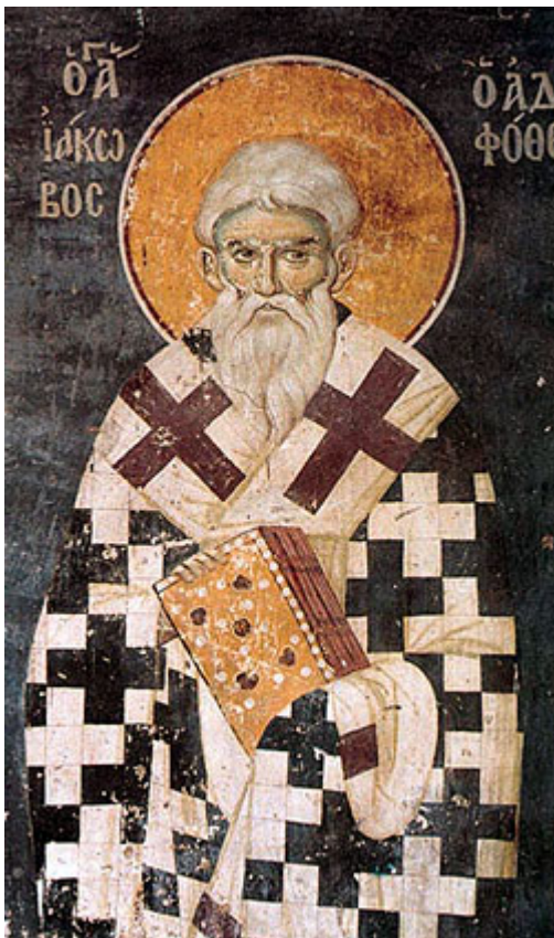
Saint James, 14th Century fresco by hand of Emmanuel Panselinos, Church of Protaton, Holy Mountain Athos

The first is the obvious similarity with John the Baptist. Both were dedicated to God from an early age and may have been Nazirites. They were popular among the people for their virtuous lives and personalities. Both were outspoken in the face of official pressure and both were killed because they represented a threat to the establishment.