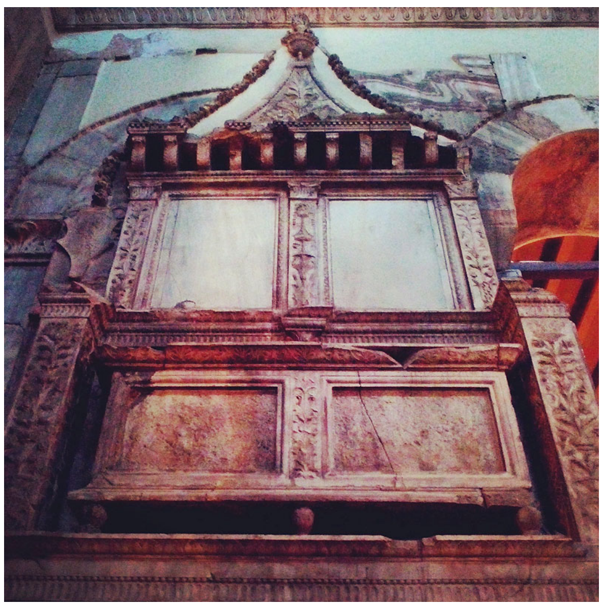
The sarcophagus containing the body of governor Loukas Spandounis, a great benefactor of the Church

order to honour this great benefactor, after he departed this life, the church allowed a Renaissance-style sarcophagus containing the body of this benefactor of the Church and nation to be placed in the N.W. wall of the central nave of the church.