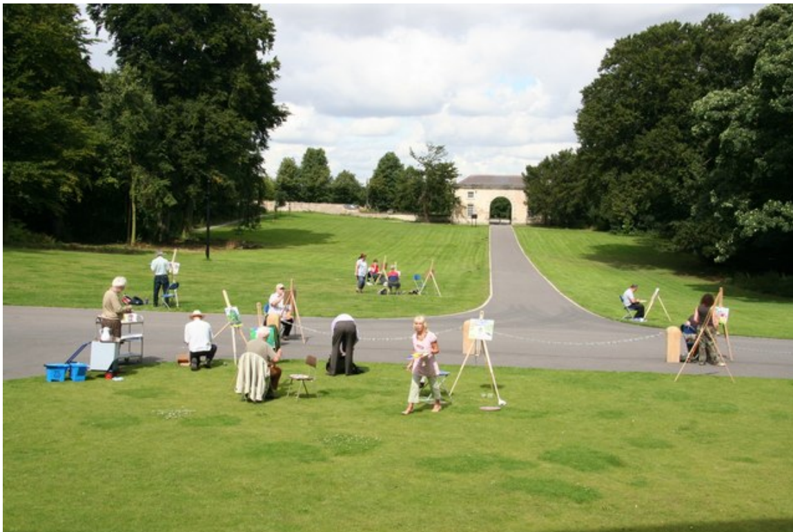
Artists teach through the works they create, and historically, they mentored those who wished to become artists.

sufficient Know What (understanding) and Know Why (wisdom) no wonder there are so many inventions and technological advances that pose a great threat to the stability and well being of the planet, from nuclear science to bio-tech, as well as in politics, education, and language. The whole deconstruction movement in art today is an outgrowth of the abandonment of wisdom, understanding, and knowledge in favor of a purely subjective view of all aspects of life, in opposition to objective reality, indeed, in denial that there is anything such as objective reality. No matter how much knowledge or Know How one has acquired, one must be humble enough to be willing to submit one's Know How to the proper context of the Know What and the Know Why.