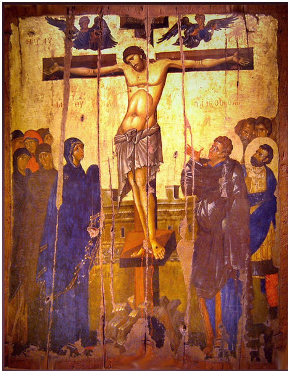
Icon of Crucifixion (God's Love)

Passing through the country of Gadarenes, our Lord came across a young man who had been taken over by a “legion” of devils for a long time. The Gospel says that the evil “often seized him, and he was kept under guard, bound with chains and shackles; but he broke the bonds and was driven in the wilderness” (Luke 8: 29). He was a danger to the people in the town and also to himself, for “he wore no clothes, nor did he live in a house but in the tombs” (Luke 8:27). He was in a rage to kill himself. Death appeared to him as a solution to rid himself of the legion of devils that possessed him. However, his trying to kill himself was nothing else but the final submission to the evil forces that had taken over his body and soul, for the ultimate goal of devils is to destroy the persons they possess.