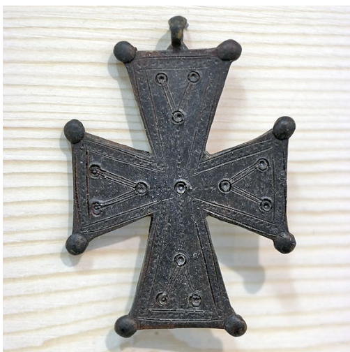
Cross by Romanian artist Ovidiu Simionescu

There are many events in the Old Testament that foreshadow the cross: the blood of a lamb placed on lintels and doorposts during Passover (Exodus 12:23); Moses lifting his staff and parting the Red Sea (Exodus 14:16); Moses’ outstretched arms in prayer for victory over Israel’s enemies (Exodus 17:8-15); and Israel being saved from poisoning by looking at a bronze serpent on a pole (Numbers 21:6-9). There are also prophetic allusions to the cross: the curse of being hung on a tree (Deuteronomy 21:23); the predicted passion of the Messiah (Psalm 22); the saving mark on the forehead (Ezekiel 9:3-6, LXX; cf. Revelations 7:2-4; 22:4); and the blood that drips from wood (2 Esdras 5:5). These references attest that the cross was always part of God’s plan for salvation.