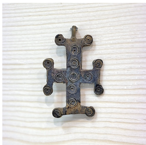
Cross by Romanian artist Ovidiu Simionescu

"In every successful undertaking, at every arrival and departure, while dressing, putting on one's shoes, in bath or at table, at lamp lighting, in bed or on seats, in a word: in all our activities, we trace the sign of the cross upon ourselves, according to the tradition of the Apostles who inspired their first disciples, and through them, all the faithful, as a sign of their confession, always to place the sign of the cross over their face and chest."