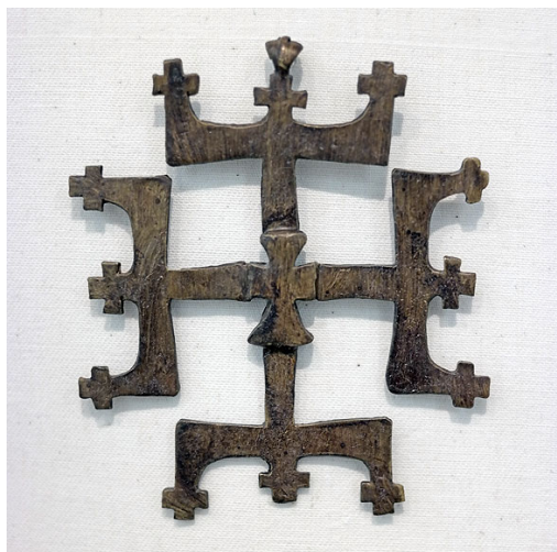
Cross by Romanian artist Ovidiu Simionescu

However, the cross not only informs you but also transforms you. Crosses are placed on graves not just to symbolize the fact the deceased was a Christian, but to also express the hope that by the cross the loved one will “cross-over” from this life to the next. There can be no resurrection without the cross. There can be no joyful entry into heaven without the cross: