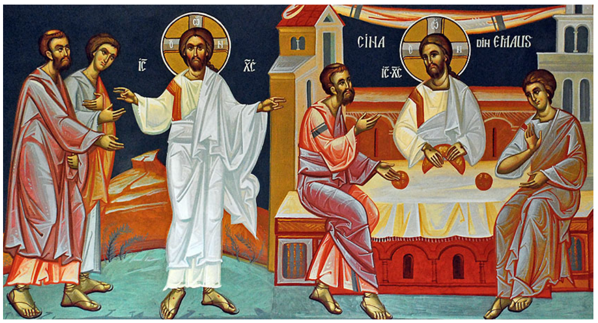
The Supper at Emmaus, fresco by Romanian iconographer Ioan Popa, Afteia Monastery

In the same way, the soul can't live unless it's ineffably and without confusion united to God, Who is truly eternal life. Before this union in knowledge, vision and perception, it's dead, albeit with an intellectual existence and an immortal nature. There's no knowledge without vision and no vision without perception. What I mean is that there is vision, and, in the vision, knowledge and perception. I'm talking about spiritual matters here, since in the corporeal realm there is perception without vision. What do I mean? A blind person who stubs their toe on a stone feels it, but a dead person wouldn't. In spiritual matters, unless the intellect attains to the vision of things beyond thought, it doesn't perceive mystical activity.