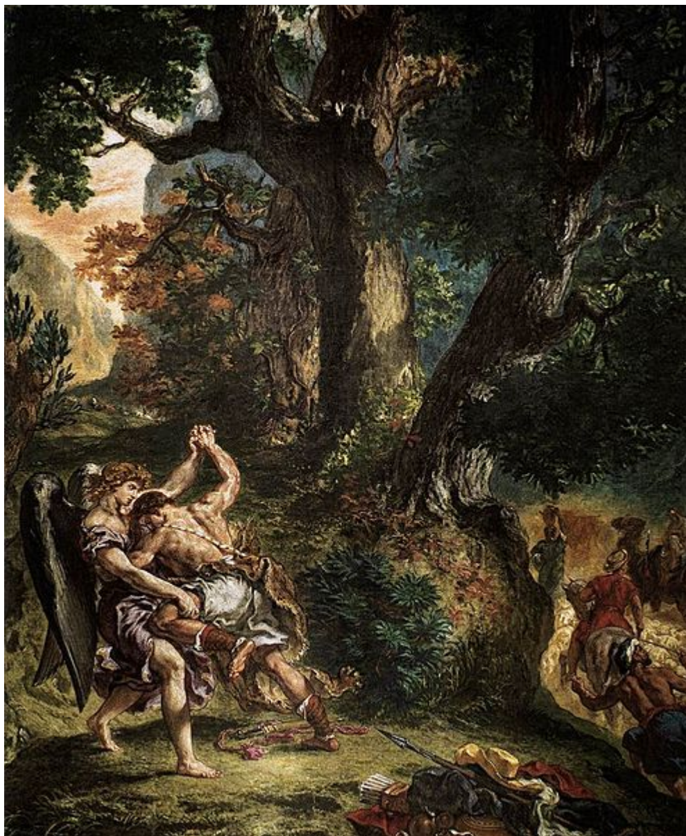
Jacob and the Angel