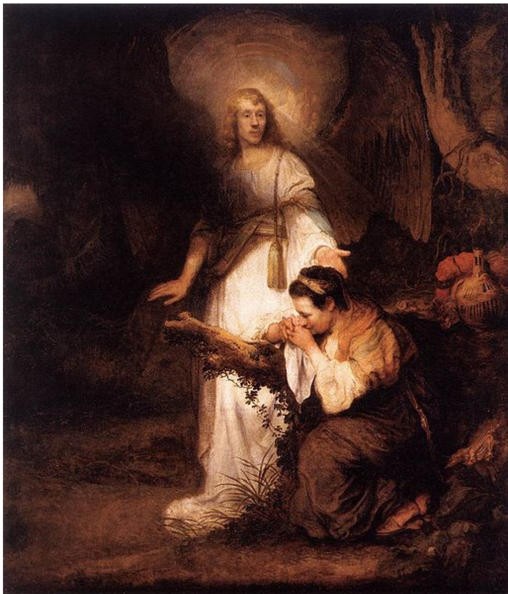
Hagar and the Angel