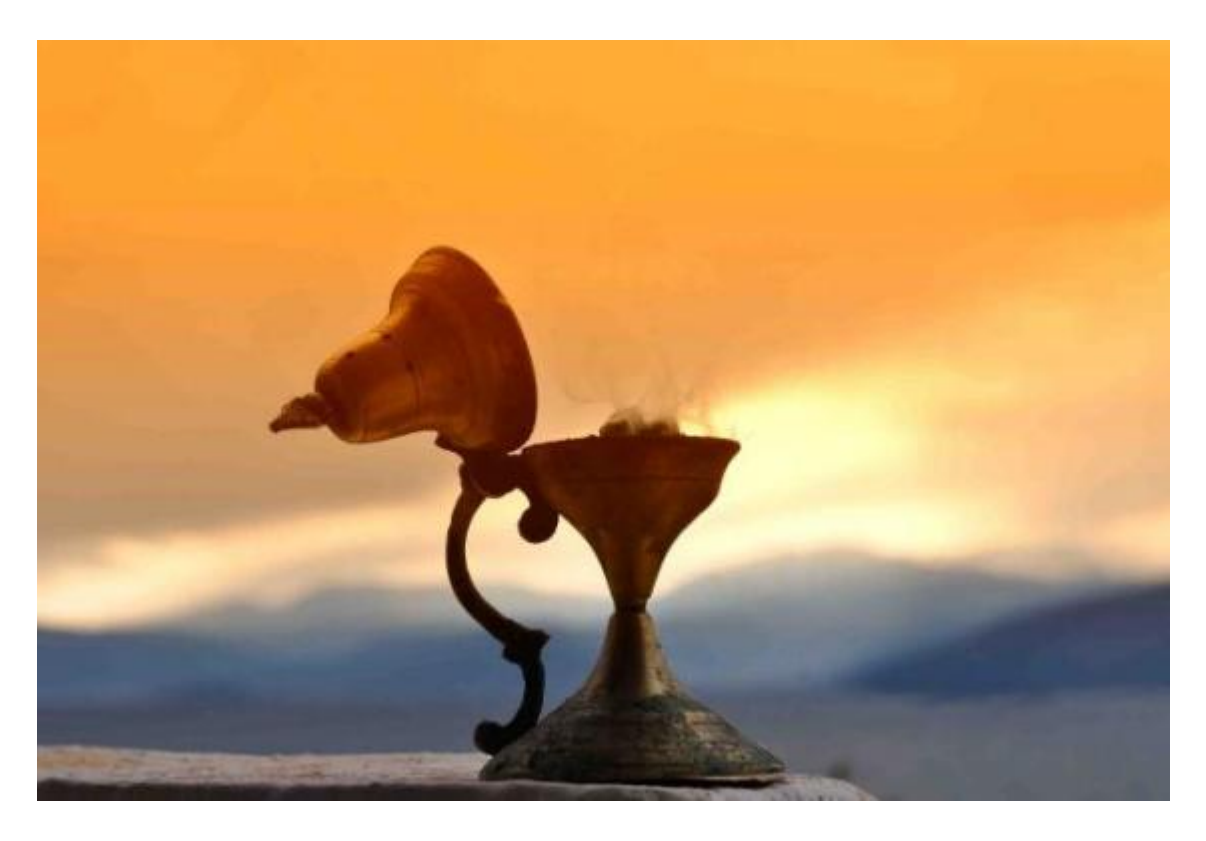
Antipathy, hatred and envy should be unknown to any Christian. We shouldn't even