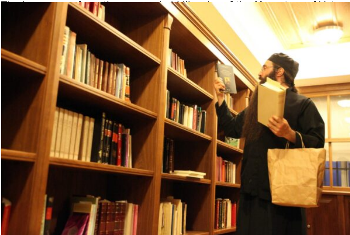
...idi, Mount e's Works, p.

If we do not care about the rights of the children, that is to love them, the spiritual law will intervene and the children will depart from us whether we want this or not.