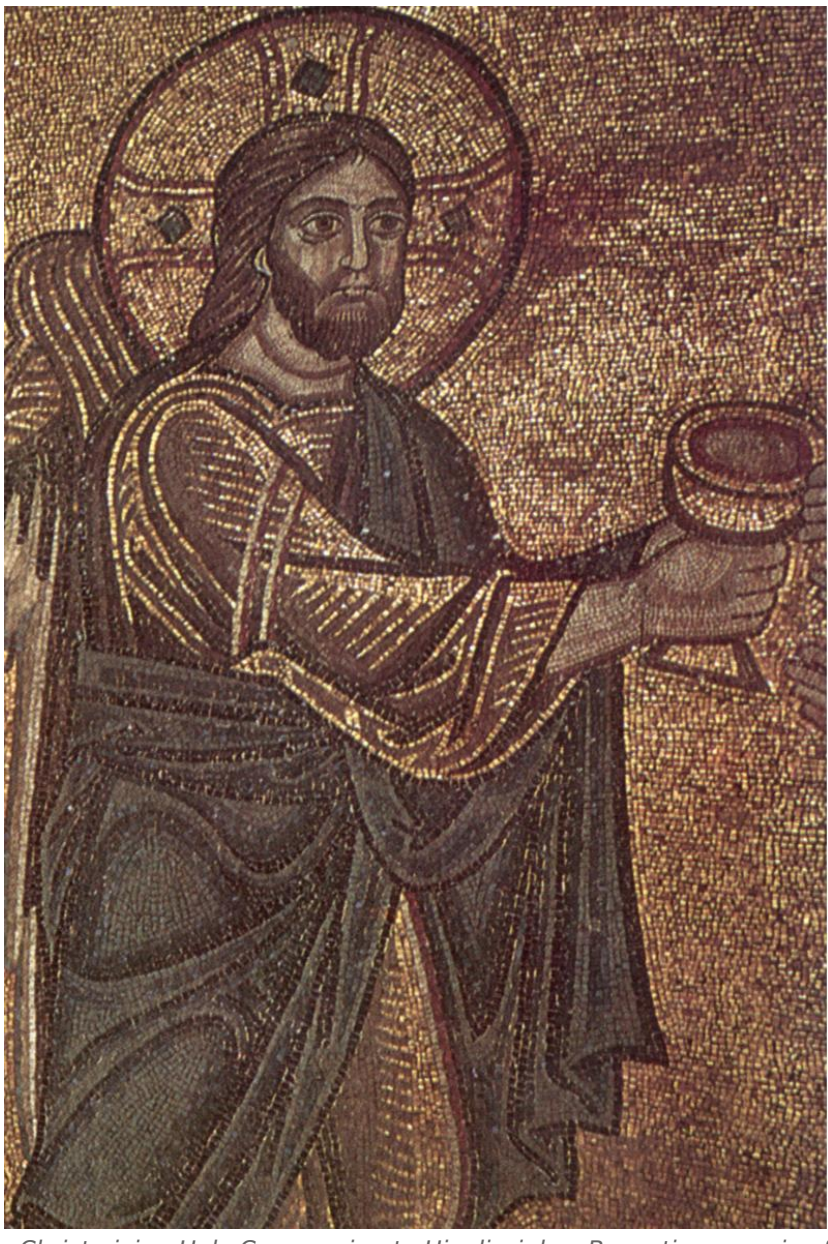
Christ giving Holy Communion to His disciples. Byzantine mosaic of the 11th century from the Cathedral of Sancta Sophia in Kiev.

After a large number of people had gathered around our Lord Jesus Christ, the Lord spoke these words: "What does it profit a man if he gains the whole world and loses his own soul?" In addition, He spoke these words: "What can a man give in exchange for his soul?"