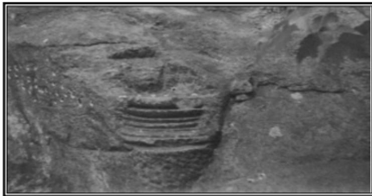
"Main Altar" with Greek Doric style plinth. To the left is fish-shaped cupule (holes) pattern. Both hold candles for ceremonies.

When I first met an older Frederick Pohl at his home in Brooklyn, New York during 1976, he asked me to go to the site, look it over and see what I could make of it. For two and a half years thereafter, I regularly visited the site gathering information, taking photographs and making drawings, followed