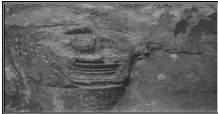
"Main Altar" with Greek Doric style plinth. To the left is fish-shaped cupule (holes) pattern. Both hold candles for ceremonies.